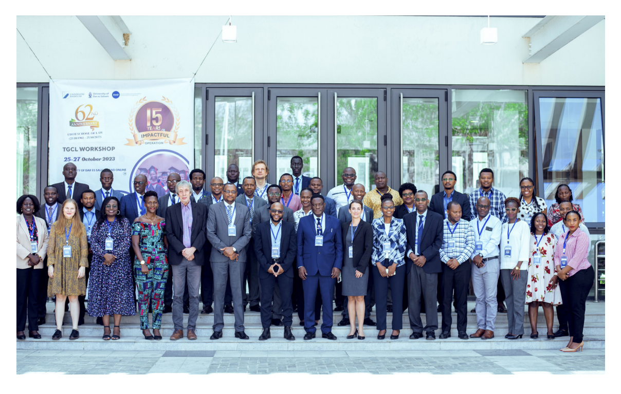
The attendees of the TGCL 15-year anniversary workshop.