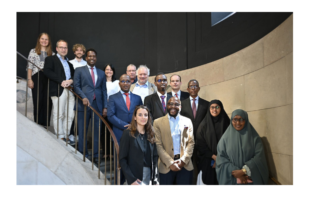
Representatives of SIMAD University and the University of Bayreuth at Iwalewahaus in June 2023.

further developments of the joint expansion of teaching and research were discussed. Another item at the top of the agenda was the Memorandum of Understanding between the Ministry of Justice and Constitutional Affairs in Somalia and the Chair of African Legal Studies in September 2022 to support the review of Somalia's current provisional constitution in an advisory capacity by providing constitutional expertise.