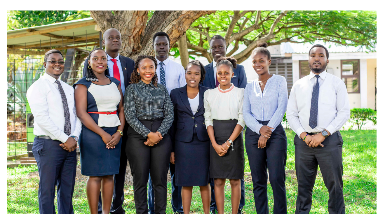
The 2020/2021 LLM students at the Mikocheni Campus.