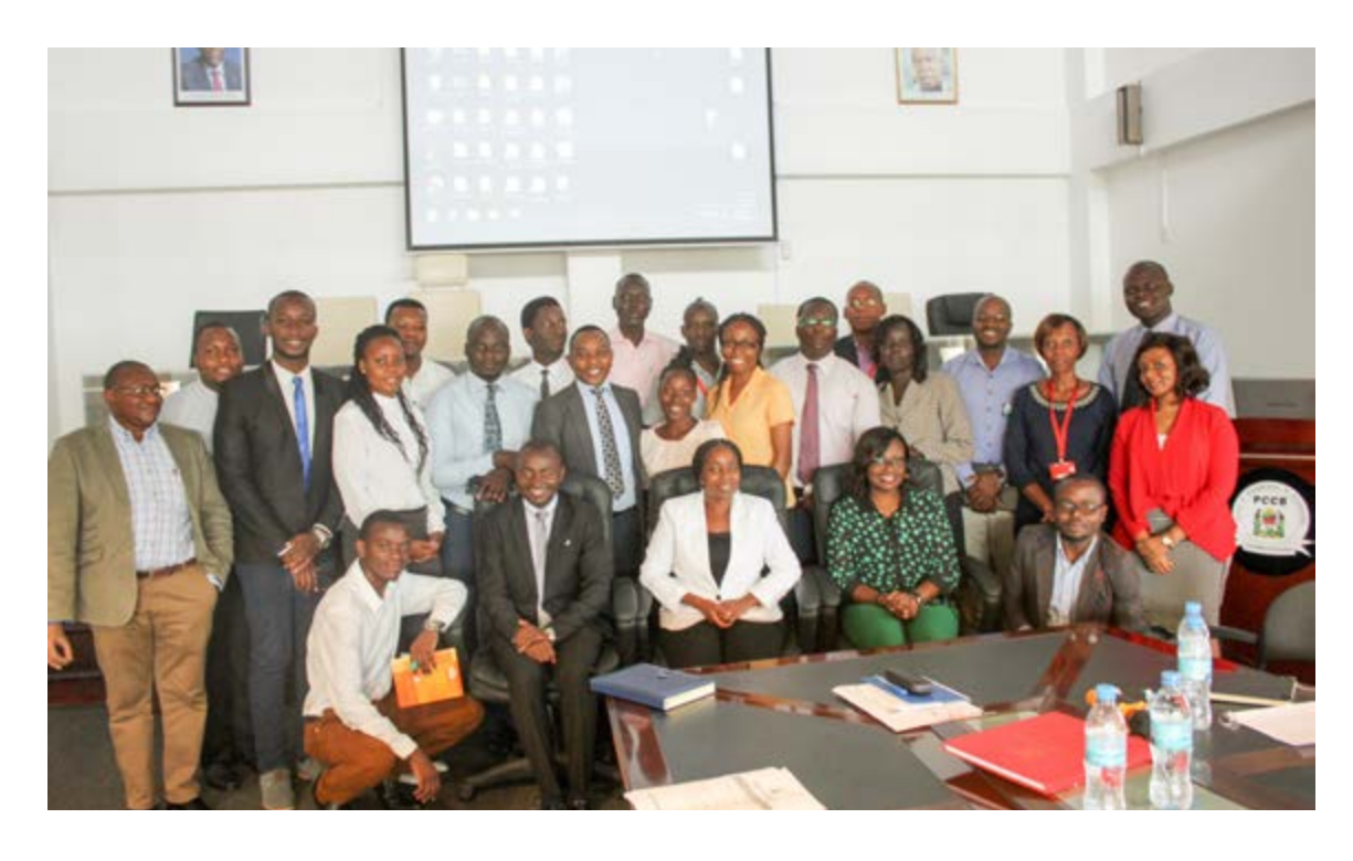
The TGCL student group at the Prevention and Combating of Corruption Bureau (PCCB).