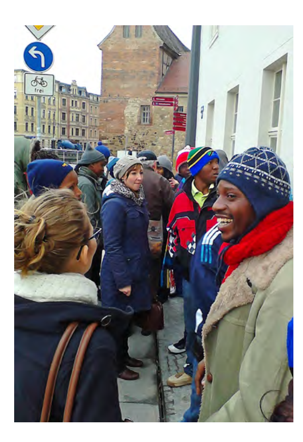
Sightseeing in Halle/Saale on a cold autumn day in